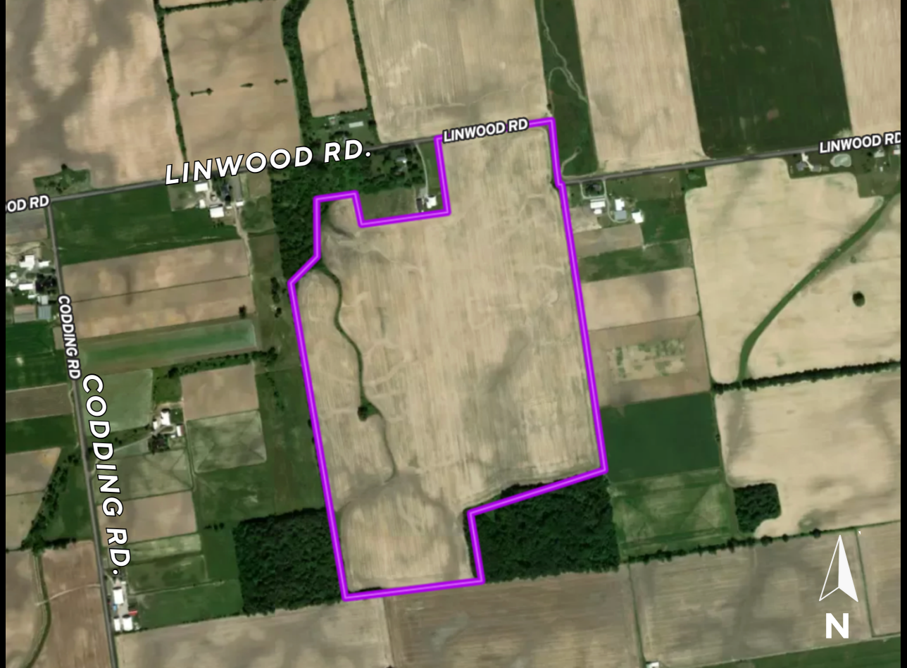
***2025 FARMING RIGHTS***